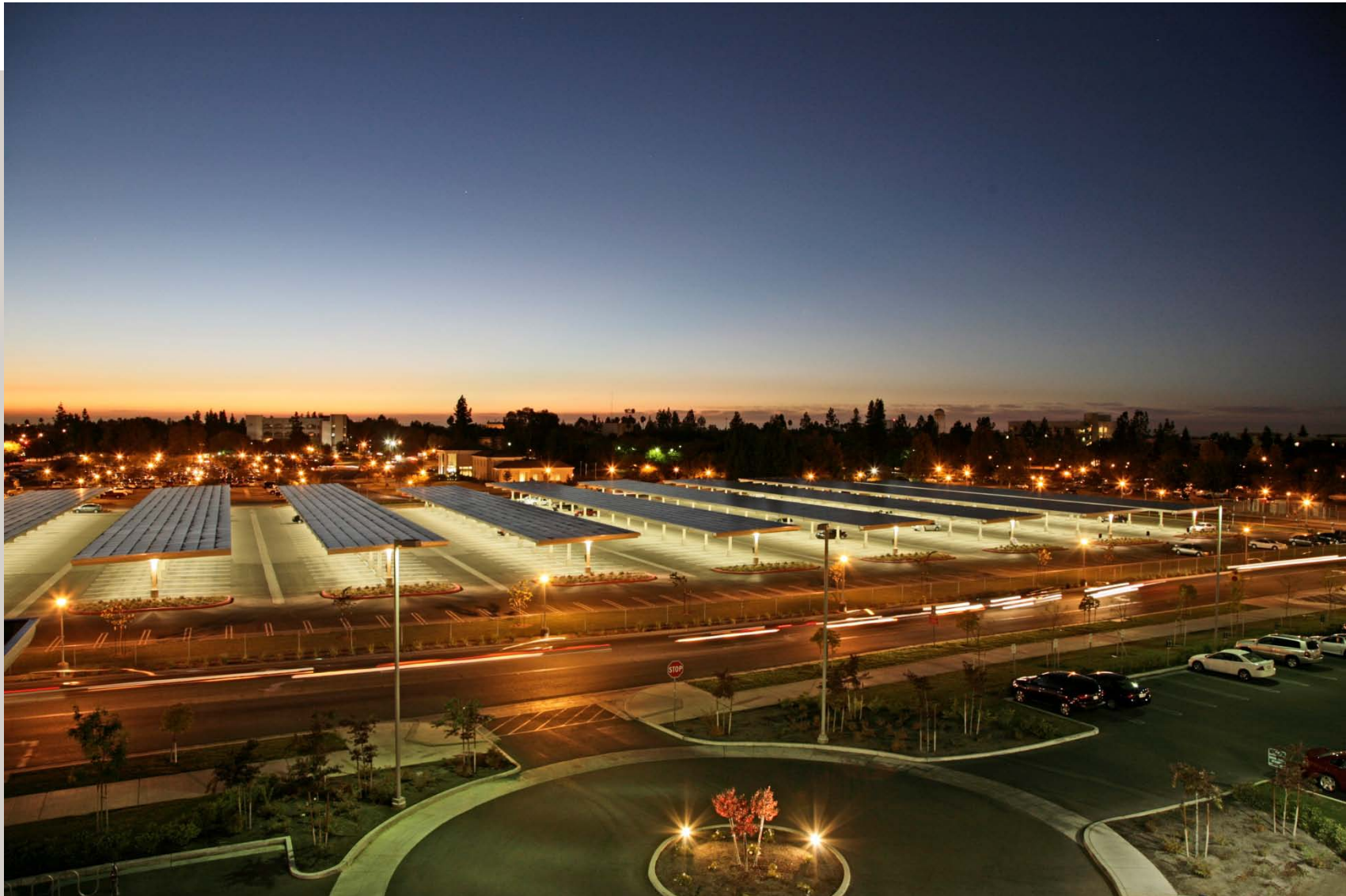
Fresno State University – 1.2 MW