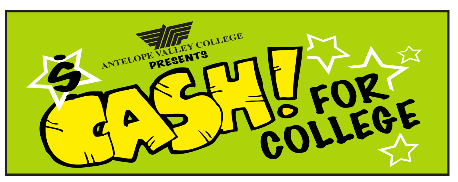
Thursday • January 21, 2016 • 10 am-2pm