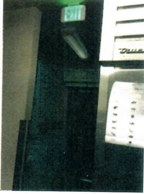
Main Campus CDC - Heavy items should not be stored overhead, the site should also encourage staff to reduce clutter. Reducing clutter is crucial with a good Integrated Pest Manage (IPM) program