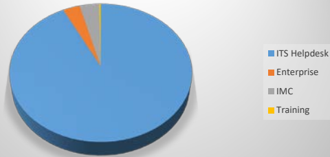
6 Month Closed Tickets