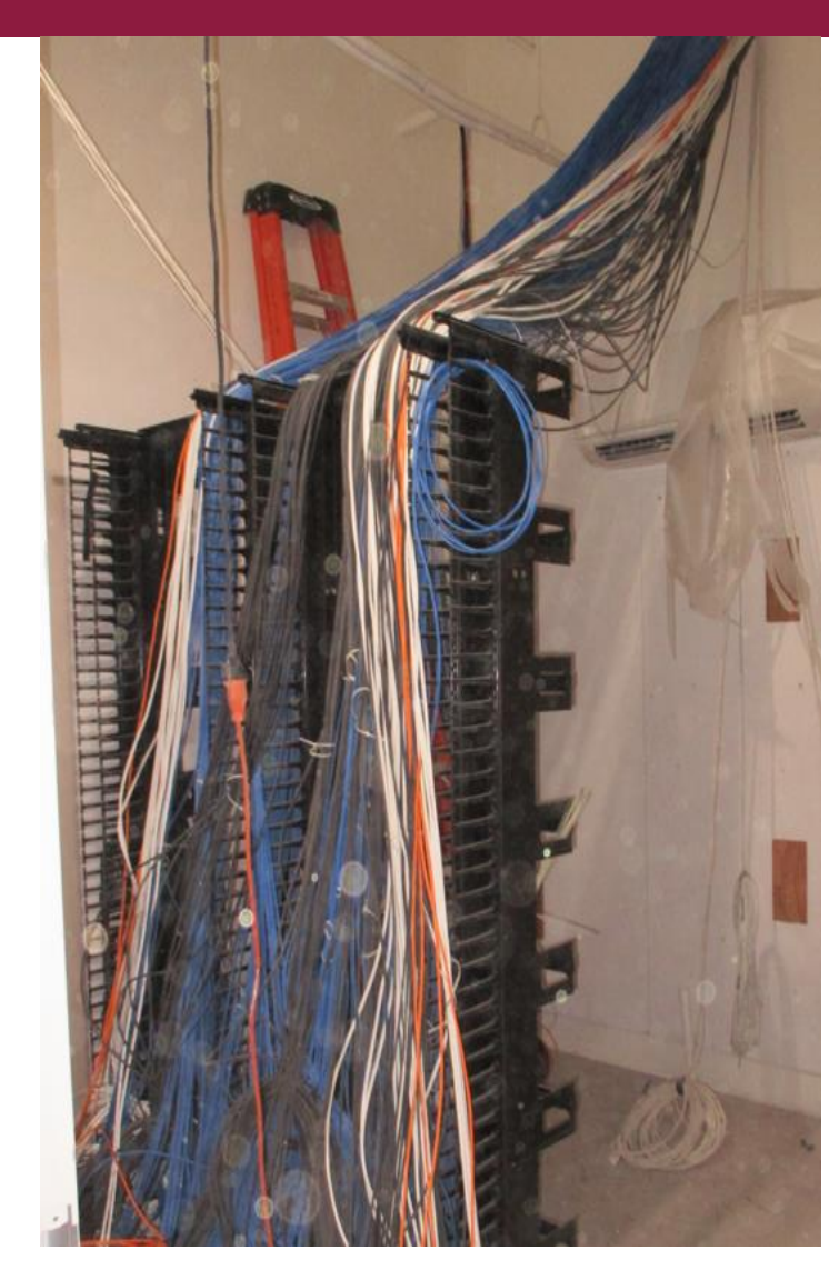
Data Room Ist Floor