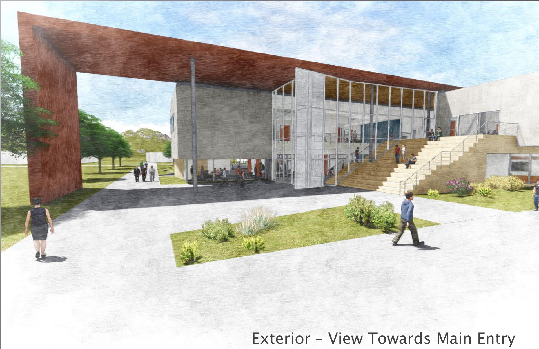
Exterior – View Towards Main Entry