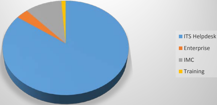
YTD Opened Tickets Distribution