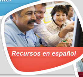
Recursos en español