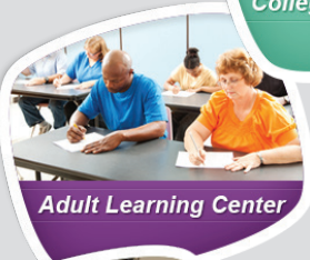
Adult Learning Center